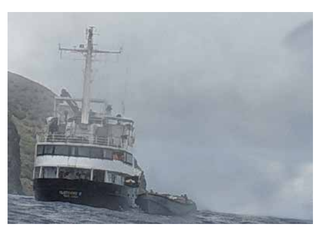
Vessel captured by Wave Glider camera and sent by Iridium satellite. High-res images available when bandwidth permits.

The Wave Glider traveled more than 10,000 kilometers during the 4-month mission, covering over 131,000 square nautical miles with acoustics and 247,000 square nautical miles with AIS. Throughout the mission, it provided the onshore team with both historical and real-time feeds of data, including AIS contacts, acoustic contact reports, weather reports, and wave reports. The Wave Glider successfully intercepted and collected data on three targets—vessels that were not picked up by the Wave Glider's AIS receiver.